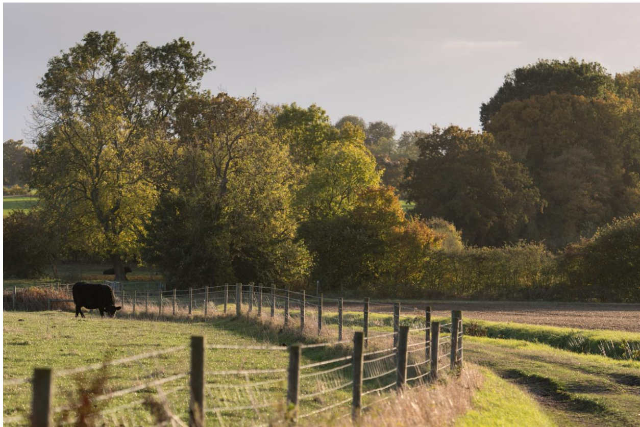
Low densities ensure maximum destruction of farmland

Very low densities are confirmed by the north Essex proposal which stipulates “average residential density 30 dwellings per hectare – allows for walkable environments and can support public transport” 12 . This is disingenuous. 30dph is about the lowest density which can support a low-frequency bus service without substantial subsidy, whereas new rail-based transit requires much higher densities to be viable. 60-100 dwellings per hectare is the minimum likely to generate a “city of short distances” where walking and cycling make up most short journeys.